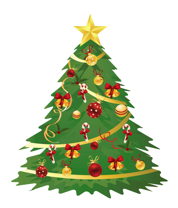
Support Trinity Services' Annual Giving Tree Program!