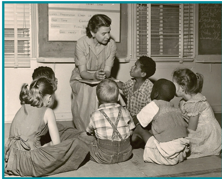
Founded in 1950, Trinity Services has become a nationally recognized leader in the fields of developmental disabilities and behavioral health.